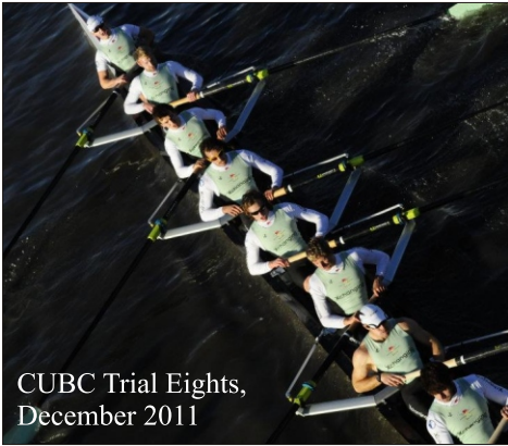
CUBC Trial Eights, December 2011