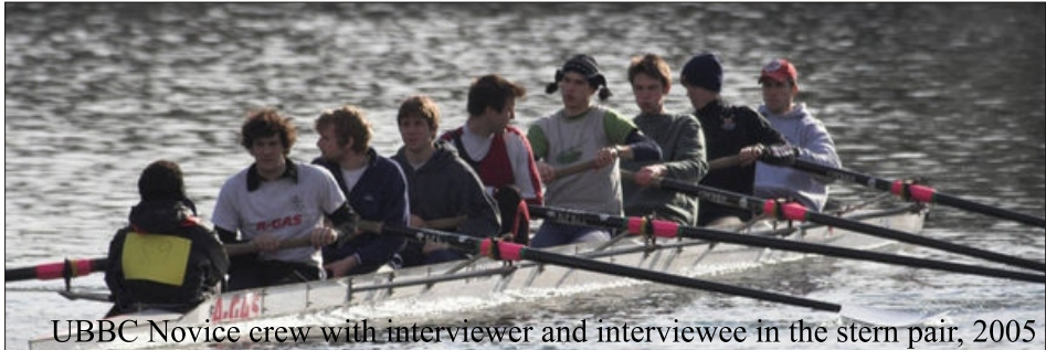
UBBC Novice crew with interviewer and interviewee in the stern pair, 2005

All members of the alumni are welcome; please get in touch through the usual channels, contact details are shown in the committee section.