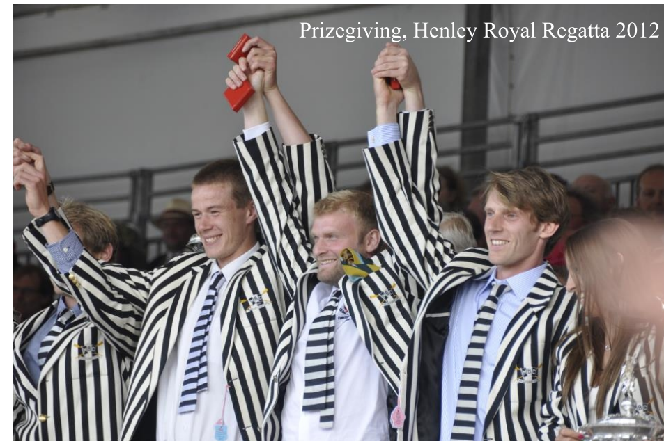
Prizegiving, Henley Royal Regatta 2012

UBBC Alumni C/o University of Bristol Alumni Office Senate House Tyndall Avenue Bristol BS8 1TH