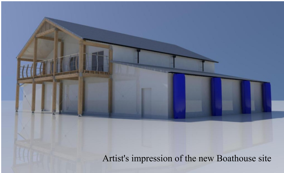
Artist's impression of the new Boathouse site