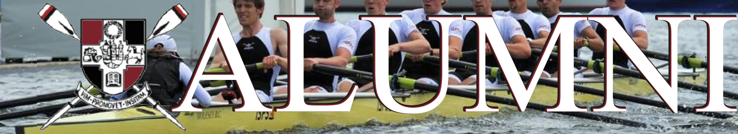
Henley Royal Regatta 2012, Thames Challenge Cup final